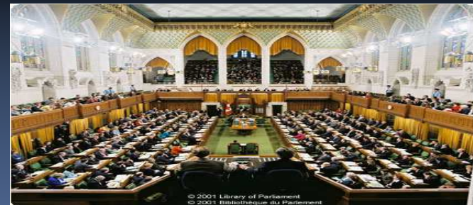
The House of Commons