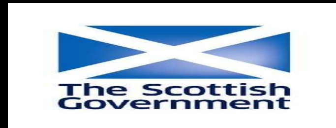
The Scottish Government