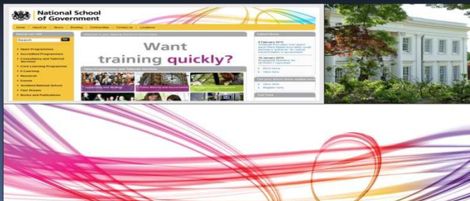
The National School of Government