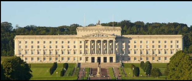
Northern Ireland Assembly